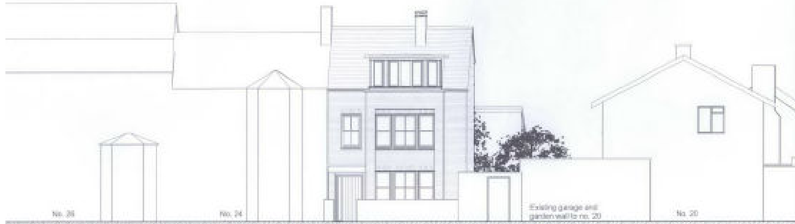
PROPOSED EAST ELEVATION TO PANTON ST.