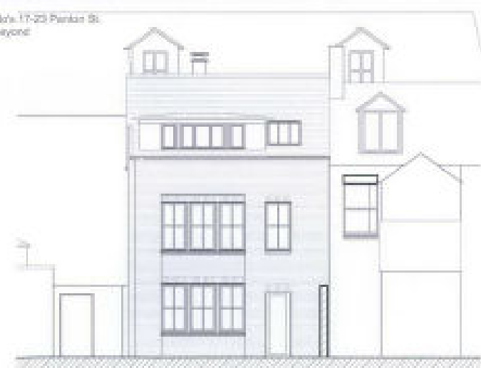
PROPOSED WEST ELEVATION TO REAR